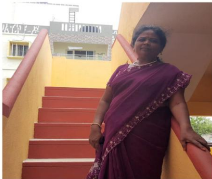
Home Nursing course